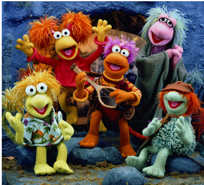
The Usual Gaggles of Fraggles